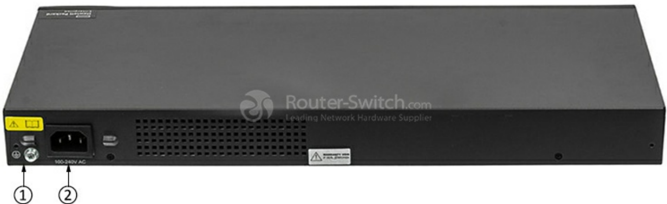
Figure 3 shows the back panel of HPE JH017A.