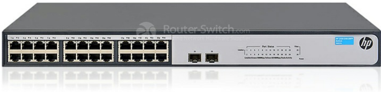
Table 1 shows the quick spec.

Figure 1 shows the appearance of HPE JH017A.